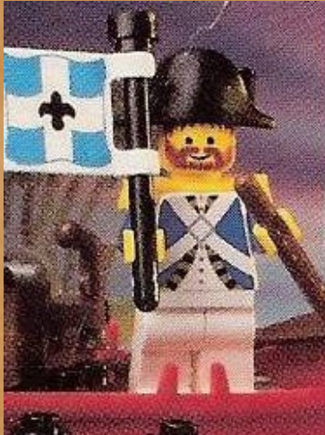
Gentlemen, start your... Cannon?

One interesting thing about the Soldier figures was that LEGO twice used different hats to expand the Soldier ranks beyond the usual Governor/Lieutenant/Troops triad of figures for individual sets.