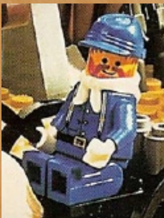
He's blue! (Da ba de da ba di!)

Like the Governor, the Lieutenant also wears yellow epaulets. His torso features a blue coat trimmed in black and gold checks, and crisscrossed white belts with a silver buckle. This figure has evidently been serving king and country for centuries; his head was used frequently in the Castle theme.