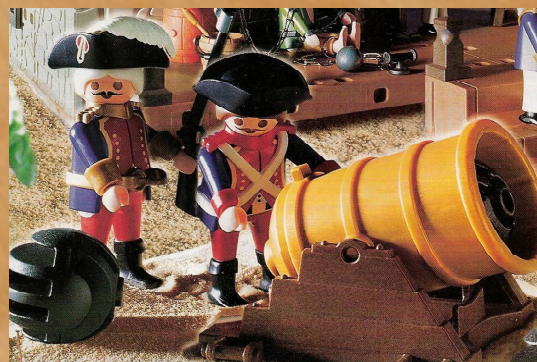
Sure, Playmobil has a few soldier sets...

The LEGO Group produced some well thought out enemies for the Pirates to steal from, or be hunted by. And these figures were some of the best ever made!