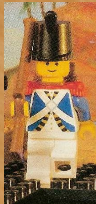
Hup, two, three, four, right, left...