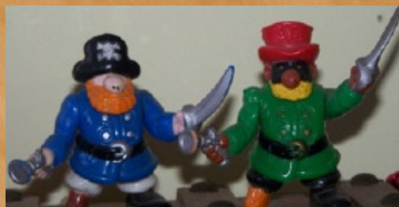
Fisher Price went with good and bad pirates