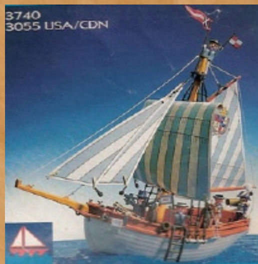
But they only made one non-pirate ship!